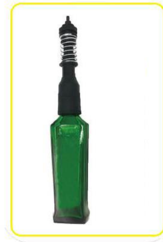
Bottle Grasping Diagram